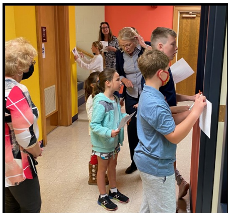
Sunday School students participated in a "Mission Possible" scavenger hunt.