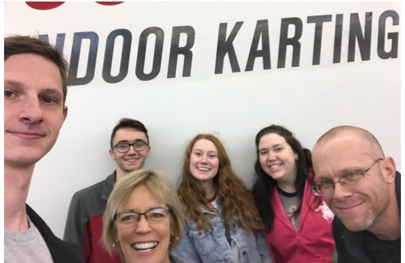
Bethany college age students gathered for a fun afternoon at Speedeezz while home for Christmas break!